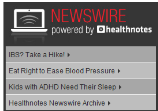
Styled Newswire Widget

We understand the value of your company’s Web presence. Seamless integration of Aisle7 ONLINE content improves your website’s cohesiveness. Matching our asset presentation—from health and wellness articles to dynamic widgets—to the styles of your site will give customers a pleasant Web experience, enhancing brand loyalty by ensuring they will return.